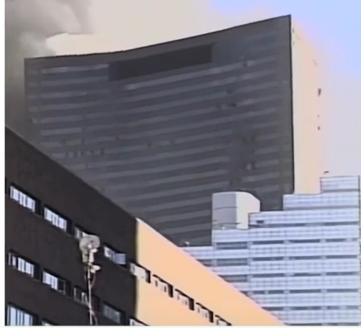
WORLD TRADE CENTER BUILDING 7